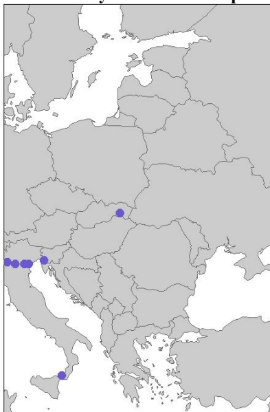
Figure 1 Cities in Italy that are of comparable population with Košice