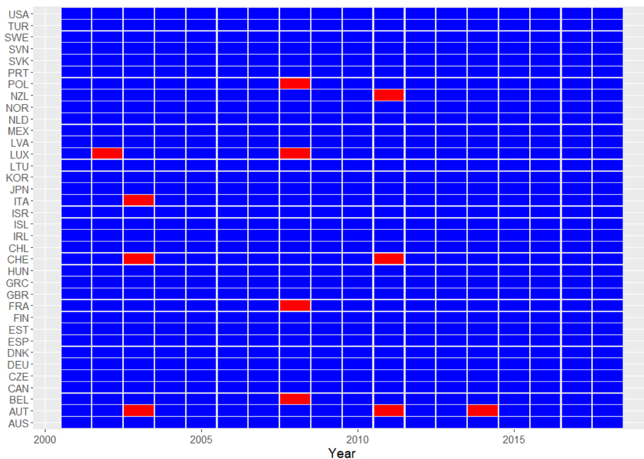
Figure 3 Distribution of identified tax shift from direct to indirect taxes, 2000-2018